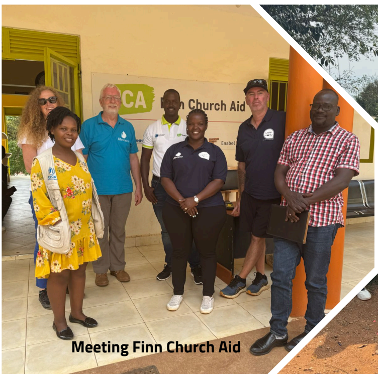
Meeting Finn Church Aid