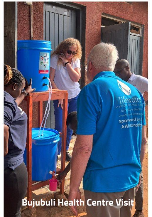
Bujubuli Health Centre Visit