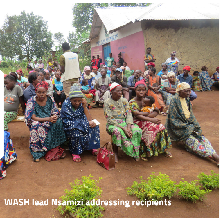
WASH lead Nsamizi addressing recipients