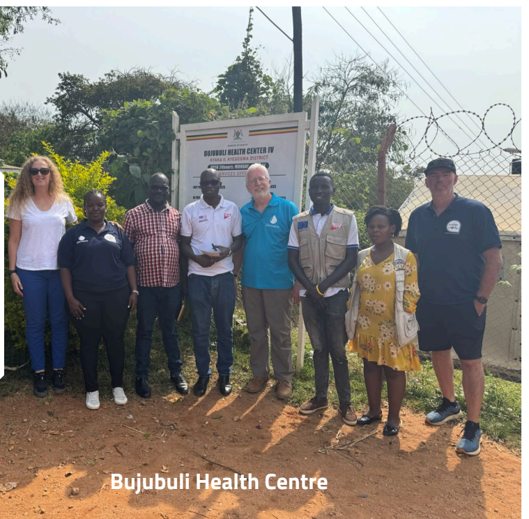
Bujubuli Health Centre