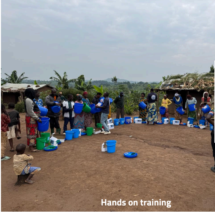
Hands on training