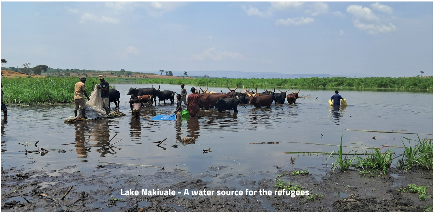
Lake Nakivale - A water source for the refugees