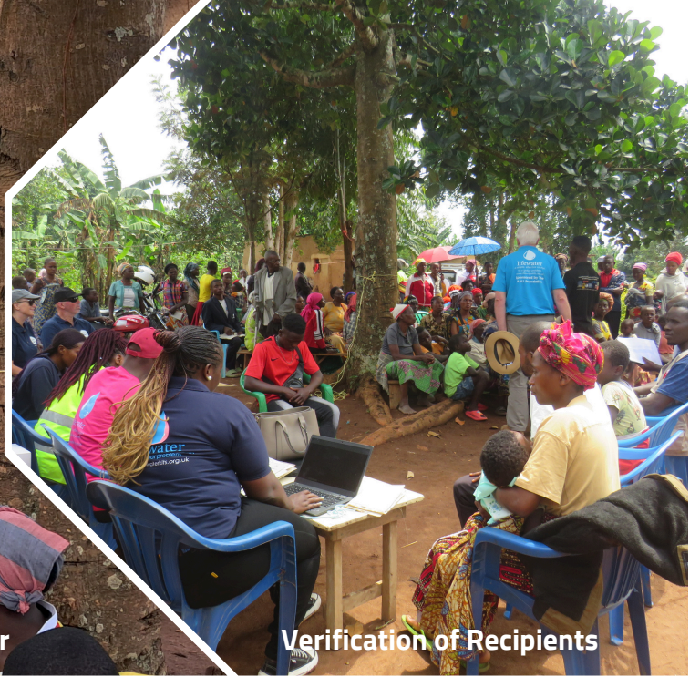
Verification of Recipients