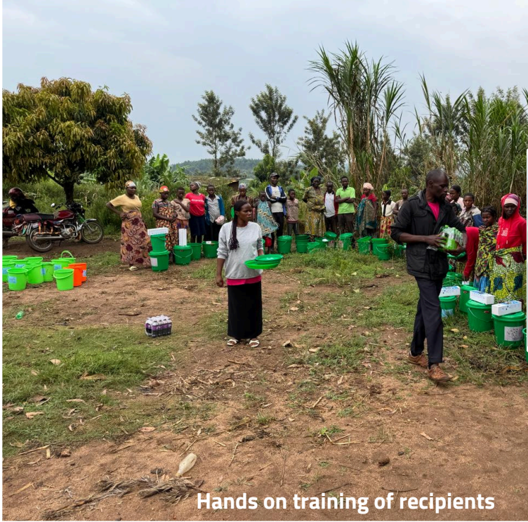
Hands on training of recipients