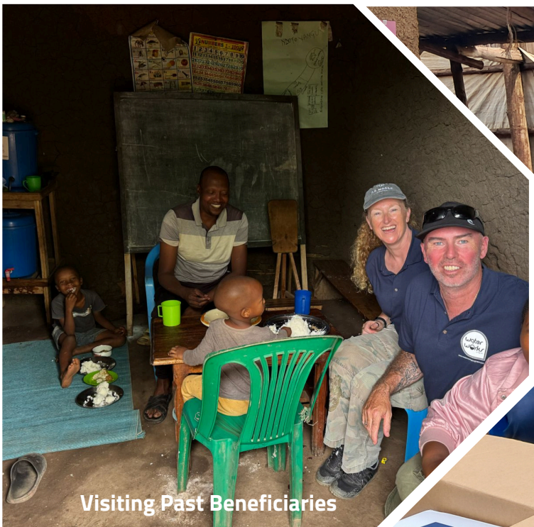
Visiting Past Beneficiaries