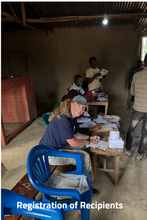
Registration of Recipients